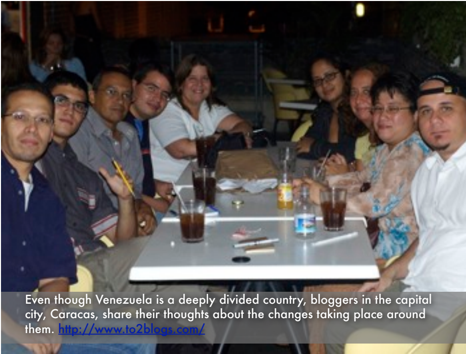
Even though Venezuela is a deeply divided country, bloggers in the capital city, Caracas, share their thoughts about the changes taking place around them. http://www.to2blogs.com/